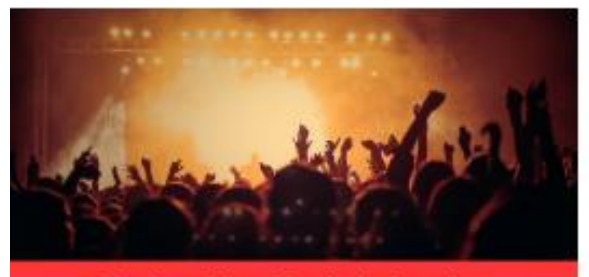
Explore Live Music in London