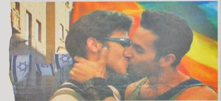
Left: a poster showing men kissing; seen from Houghton Street in the light of an LSE security guard last week, seen from Union building and the president of the LGBT society

LGBT for LSE? The poster a School official didn't want you to see >>>