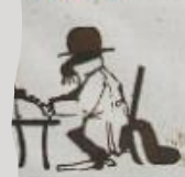
In the Beaver's anniversary issue, every day at 1pm