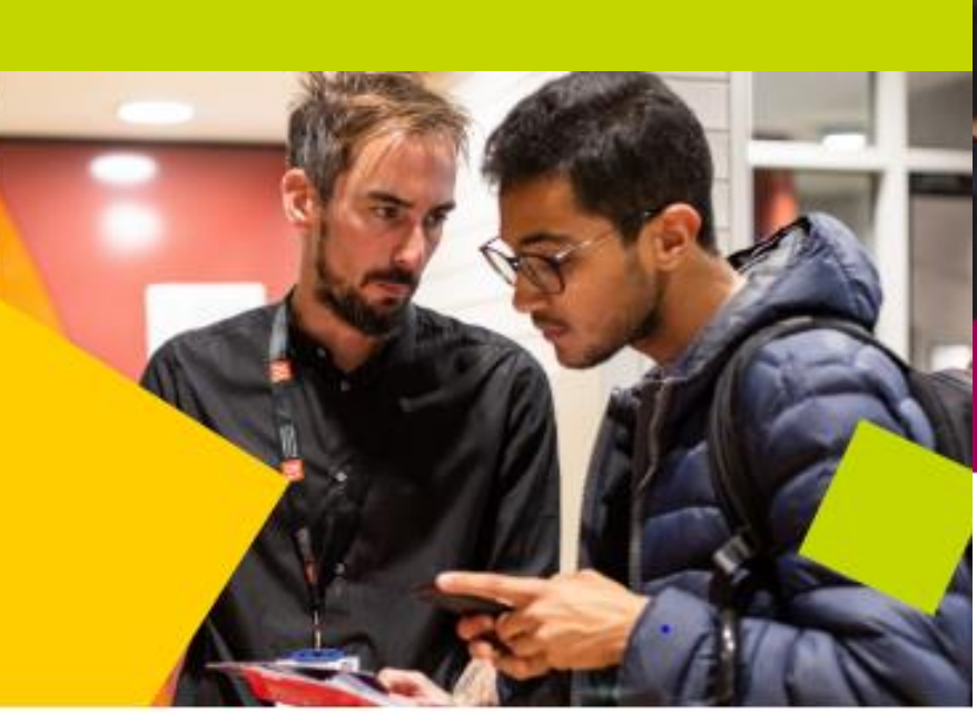
Information and resources Browse our advice on a range of careers topics