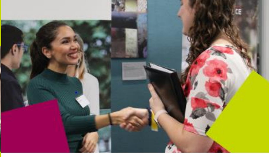
Jobs and opportunities Search for roles across organisations worldwide