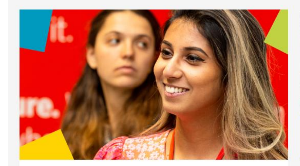
This term at LSE Careers More information about our summer offer coming soon...