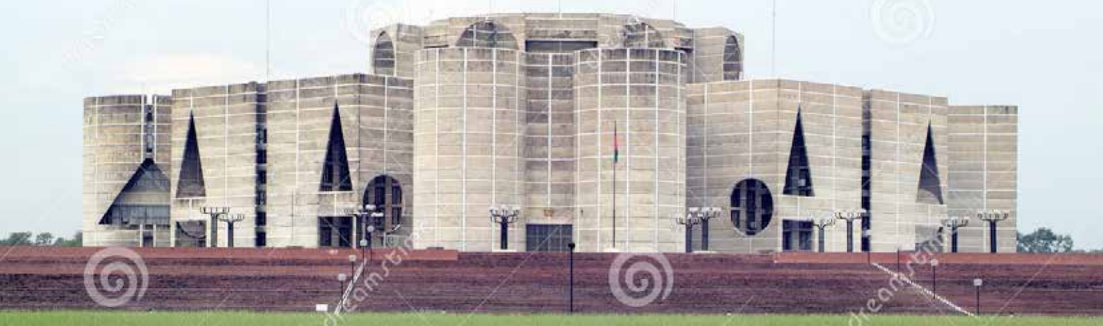
FROM TOP LEFT: BANGLADESHI WOMAN, DHAKA ; SARI WOVEN AT SONARGOAN ; BOATS ON THE BHOIRAB RIVER ; PARLIAMENT HOUSE OF BANGLADESH