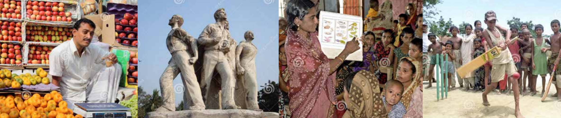
FROM LEFT: FRUIT SELLER ©M.A.K. CHOUDHURY/DREAMSTIME; UNITY, PEACE AND FREEDOM SCULPTURE ©S.A.F. KHAN/DREAMSTIME; WOMEN BEING EDUCATED IN NUTRITION ©SJORS737/DREAMSTIME; BOYS PLAYING CRICKET ©SJORS737/DREAMSTIME