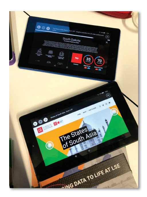
'STATES OF SOUTH ASIA' PORTAL EXHIBITED AT 'LSE RESEARCH SHOWCASE', 19 NOVEMBER 2019.

The portal not only attracted an audience outside the LSE but was twice commended within the School at internal and external set-piece LSE events alongside digital projects created by the US Centre and the Centre for Women, Peace and Security. It was chosen to be exhibited — at the LSE Research Showcase on 19 November 2019, and again on 7 March 2020 as part of the LSE Festival: Shape the World — as a pioneering example of how digital technologies can be used and designed to showcase LSE's wide-angled expertise to inform people about politics and policy, an outstanding example of Research Impact Excellence in the School.