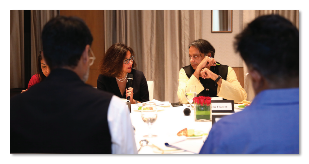
(FACING THE CAMERA) MUKULIKA BANERJEE, MINOUCHE SHAFIK AND SHASHI THAROOR, WITH (BACK TO CAMERA) SAMIR SARAN (IN BLACK) AND SHIV SAHAI (IN BLUE) DISCUSSING 'FOREIGN POLICY AND THE GROWING ROLE AND RESPONSIBILITIES OF INDIA', 9 SEPTEMBER 2019, NEW DELHI.