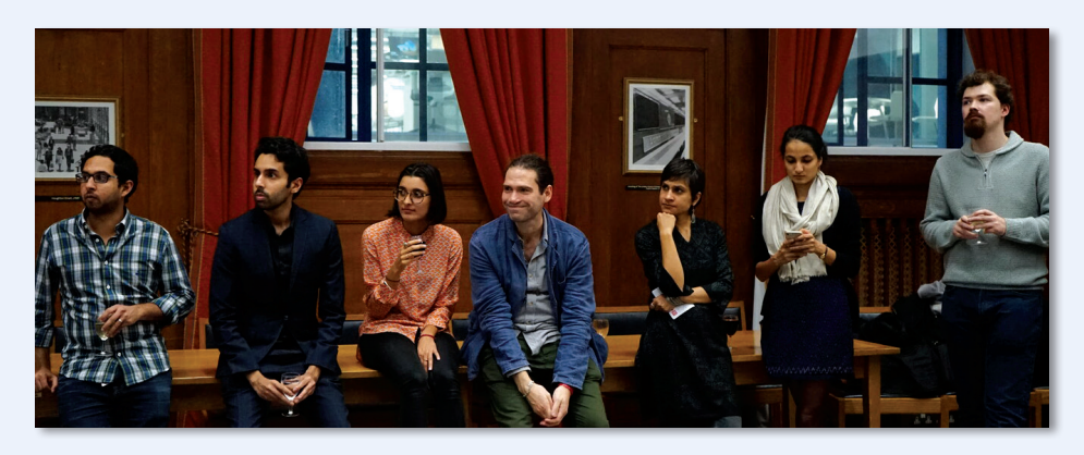
LSE PHD, POST-DOCTORAL RESEARCHERS AND TEACHING & RESEARCH FELLOWS AT WELCOME DRINKS RECEPTION. 11 OCTOBER 2019.

on South Asia across the School's several departments. This year, it brought together a record number of people who had the opportunity to interact with and discuss their interests with others working on South Asia. Over the years, the Centre has often been complimented for this mini annual event by attendees who felt that they would otherwise never get the opportunity to meet and know of each other's work. The Centre was also able to interest several research scholars to review books for the Centre's blog, providing them with the opportunity to publish, and to involve them in the Centre's showcasing of emerging talent at LSE.