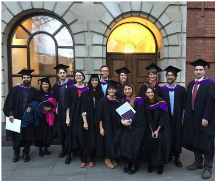
MSc City Design graduates at the LSE Graduation Ceremony December 2016

Cities Programme newsletter issue 19 Lent Term 2017