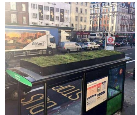
Keep off the grass! TfL's new 'buzzstop'

"We welcome you to visit and post photos and feedback about this new feature on social media using the hashtag #Buzzstop."