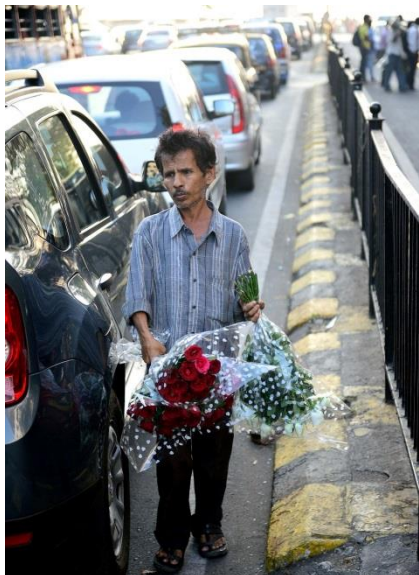
Roadside flower seller, Mumbai.