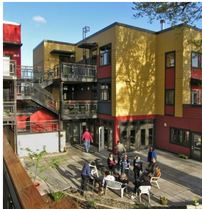
Schemata workshop, Daybreak Cohousing, Portland, Oregon.

organization's future, leading up to its 25th Anniversary in 2016. I will be leading a new research project with the generous support of the Graham Foundation for Advanced Studies in the Fine Arts: for more see webpage . Please get in touch if you'd like to learn more about this project, or perhaps be involved: mail@sarahichioka.com .'