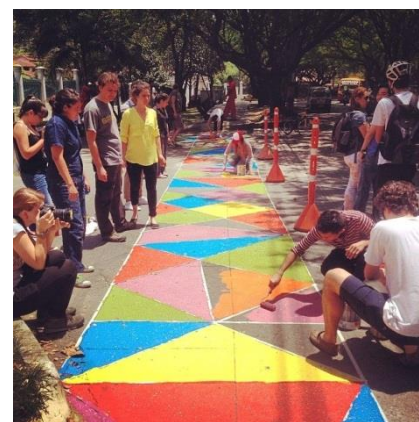
Tactical urbanism by La Ciudad Verde

At the World Urban Forum 2014 held in Medellin, La Ciudad Verde launched the first Colombian Urban Sustainability Award for best cities' efforts, and citizens' actions towards sustainability.