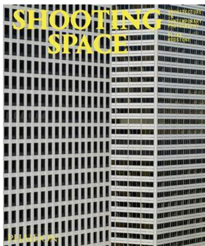
Cover of Shooting Space: Architecture in Contemporary Photography (Phaidon).

Elias will be co-curating an exhibition at the Barbican Art Gallery, 'Constructing Worlds: Photography and Architecture in the Modern Age', from 25 September 2014 – 11 January 2015. The exhibition brings together 250 works by 18 leading photographers from the 1930s to now, who have changed the way we view architecture and think about the world in which we live.