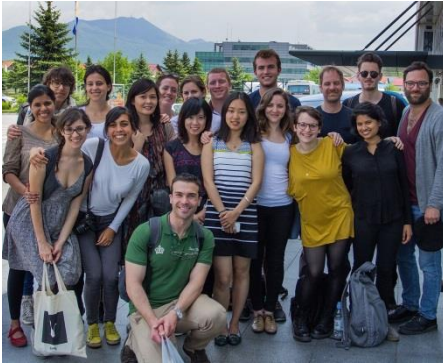
Sarajevo field trip, image courtesy of Regina Kertapati.