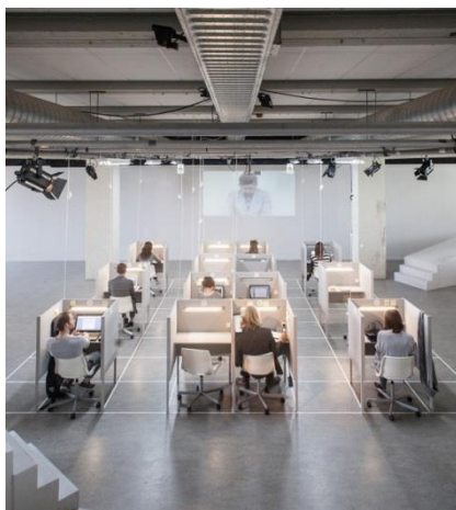
Out of Office project – 'rigid'