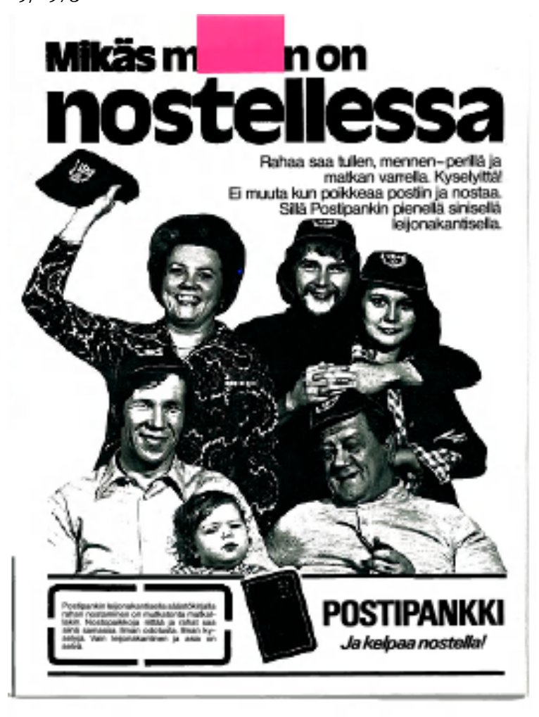
Figure 3 : Postipankki's ad about the ease of spending in Suomen Kuvalehti magazine 19/1973.

Signs of the customer relationship approach were already evident in the 1970s ads with a gradual rather than a clearcut shift in marketing thinking. An interesting example of this is the 1973 Helsingin Osakepankki's advertisement where the customer is positioned as an equal partner.