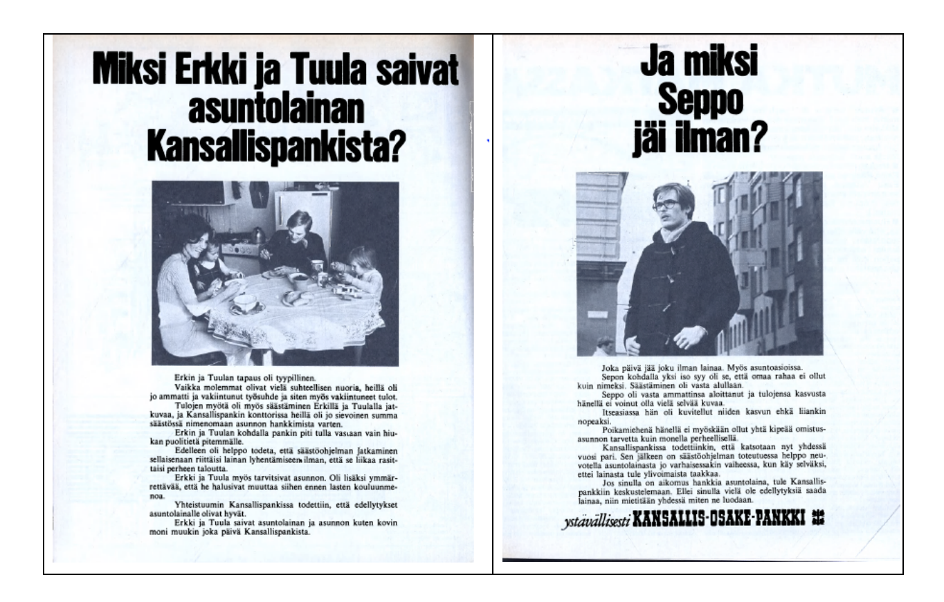
Figure 2. Mortgage advertisement of Kansallispankki, Apu 42/1973.

This ad shows how banks in the 1970s were already segmenting the population and adopting a typical CRM approach. The banks were prepared for customer segmentation based on their collection of customer data before the introduction of electronic databases and new information technology (see Dholakia and Zwick, 2004: 216-217).