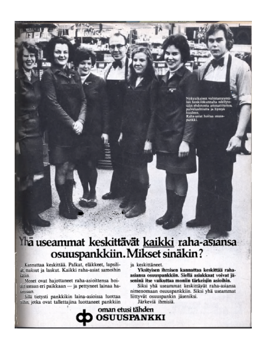
Figure 1: 1973 Osuuspankki Bank advertisement aimed at 'sensible people'.

The image in this advertisement shows the staff of a small grocery store posing and smiling at the camera. Other ads part of the same campaign, show representations of young and middle-aged working men and women, such as postmen, bus drivers, bakers and kindergarten teachers. This variety demonstrates that anyone earning a regular income will