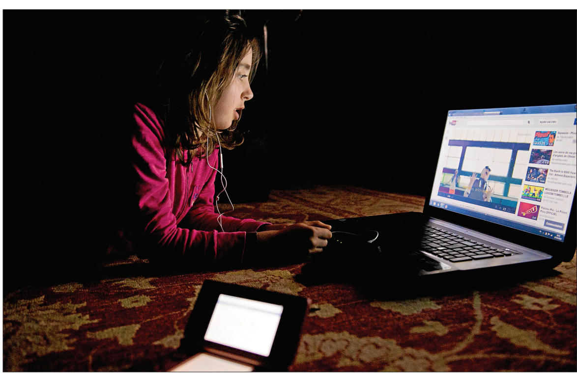
Looking and learning: The online world provides young people with unprecedented levels of autonomy and independence at a time in their lives when they have limited measures of both.

Many parents wish to limit these risks and attempt to control young people's use of ICTs. But there is growing evidence that attempting to prevent children's exposure to risks and to control their activities online may not be the best approach. Emerging international and local research shows that it is only in a very small percentage of cases that these risks translate into