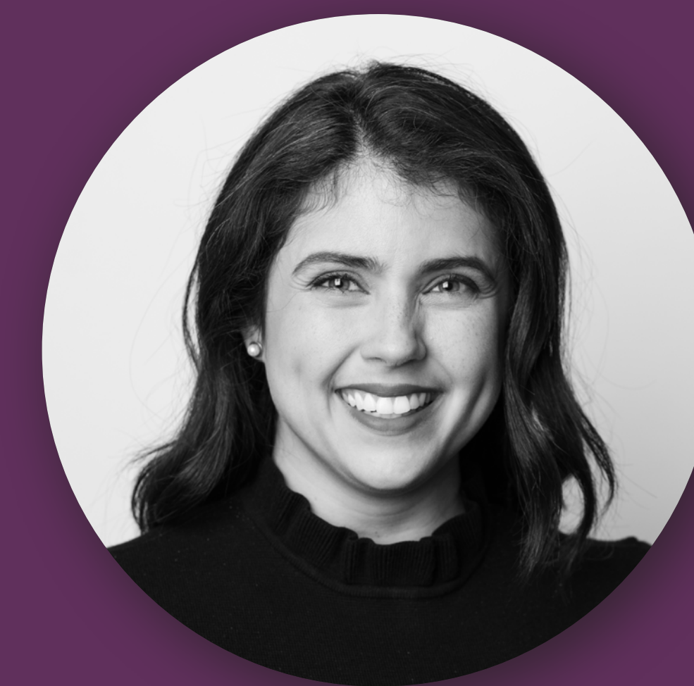
Read Yarissa's full profile.

The flexible format – seven modules over 17 months requiring just nine weeks out of the office – is designed for working professionals. Delivered in short, intensive teaching blocks to fit your career, family, and personal commitments. You'll be able to learn on your terms, studying while you work and leading while you learn.