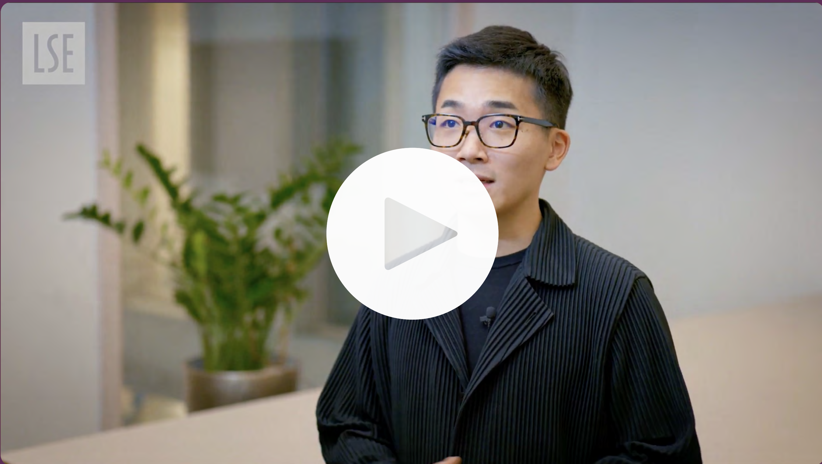
Meet four EGMiM students from the 2024/26 cohort