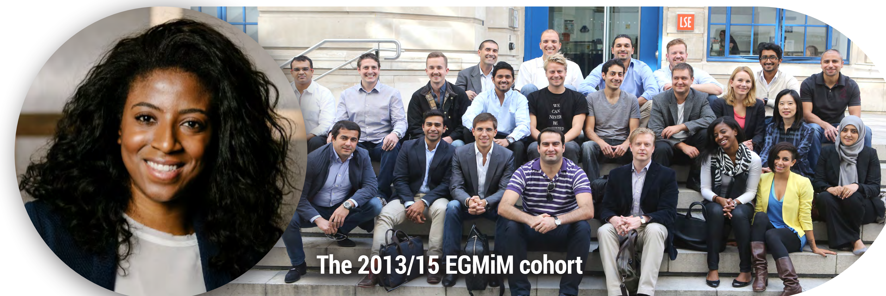
The 2013/15 EGMiM cohort