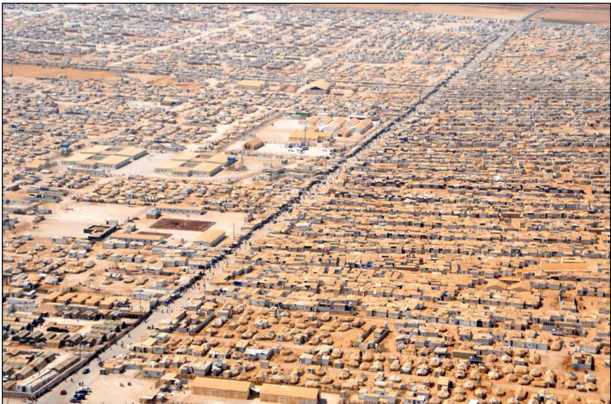
The Zaatari refugee camp in Jordan. Millions of refugees remain in camps awaiting resettlement.

The Kurds, on the other hand, are apprehensive. Despite their successes against IS, they remain under threat from Turkey and the Assad regime. Turkey is terrified of a strong Kurdish polity on its border and will feel emboldened to weaken Kurdish control after its successes elsewhere in northern Syria. Assad has stated his intent to reconquer the rest of Syrian territory, either militarily or through negotiation. Negotiations would probably mirror reconciliation deals between Assad and other opposition groups, in which some autonomy has been granted in exchange for falling under the control of state institutions. However, Assad would see any such deal as a stepping stone towards exerting total control over eastern Syria. The Kurds know this, but may find themselves in no position to fight the Syrian regime militarily. That would depend on US support, which they do not feel they can count on given the unpredictability of President Donald Trump, betrayals by previous US administrations and the not unreasonable belief that the US will prioritise its alliance with Turkey.