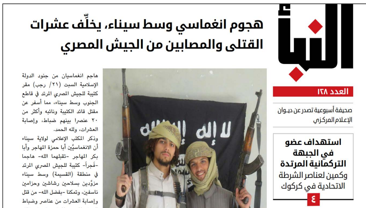
Screenshot from local media

To address these problems, IS has switched to easier production and dissemination techniques. Within Iraq and Syria, its media has become much simpler, mirroring its production before 2014. It often features only a list of operations, designed to demonstrate its military prowess.