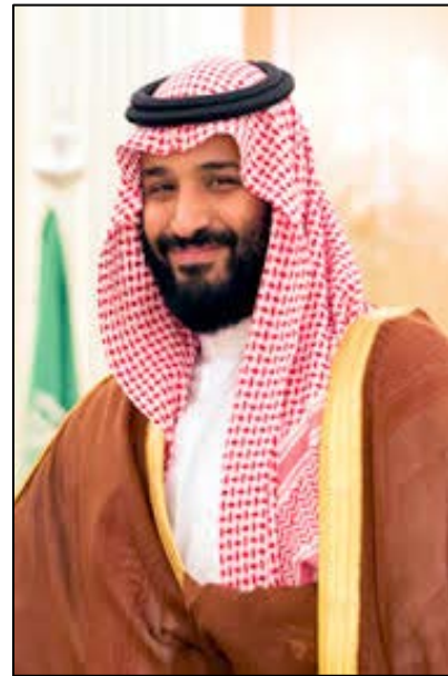
Crown Prince Mohammed Bin

It is not, however, business as usual. There have been some shifts in how regional actors view the problem. Many of the conspiracy narratives continue to resonate, but clerics across the region and the Saudi state have begun to publicly accept that the way Sunni Islam is taught in many mosques, regardless of the strain of Islam, has contributed to the rise of extremism and the allure of Salafi-jihadist groups. Crown Prince Mohammad Bin Salman has even openly criticised how the Islamic faith is being expounded across the Middle East. The recognition of the problem, however, is yet to translate into concrete solutions. The Saudis remain intent on controlling the Sunni narrative, but are yet to formulate a credible alternative.