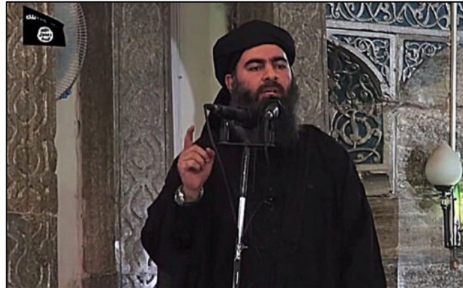
Abu Bakr al-Baghdadi shortly after the declaration of the Caliphate

The second attraction was clearly the Caliphate itself. This brought in a much wider demographic than those witnessed in other conflicts, moving beyond migrants motivated by the glory of fighting or protecting Sunni civilians, to those wanting to form part of a utopian societal project. Many of these people felt alienated from their current societies, believing them to lack opportunities and excitement. Travelling to live in the Caliphate offered a way out.