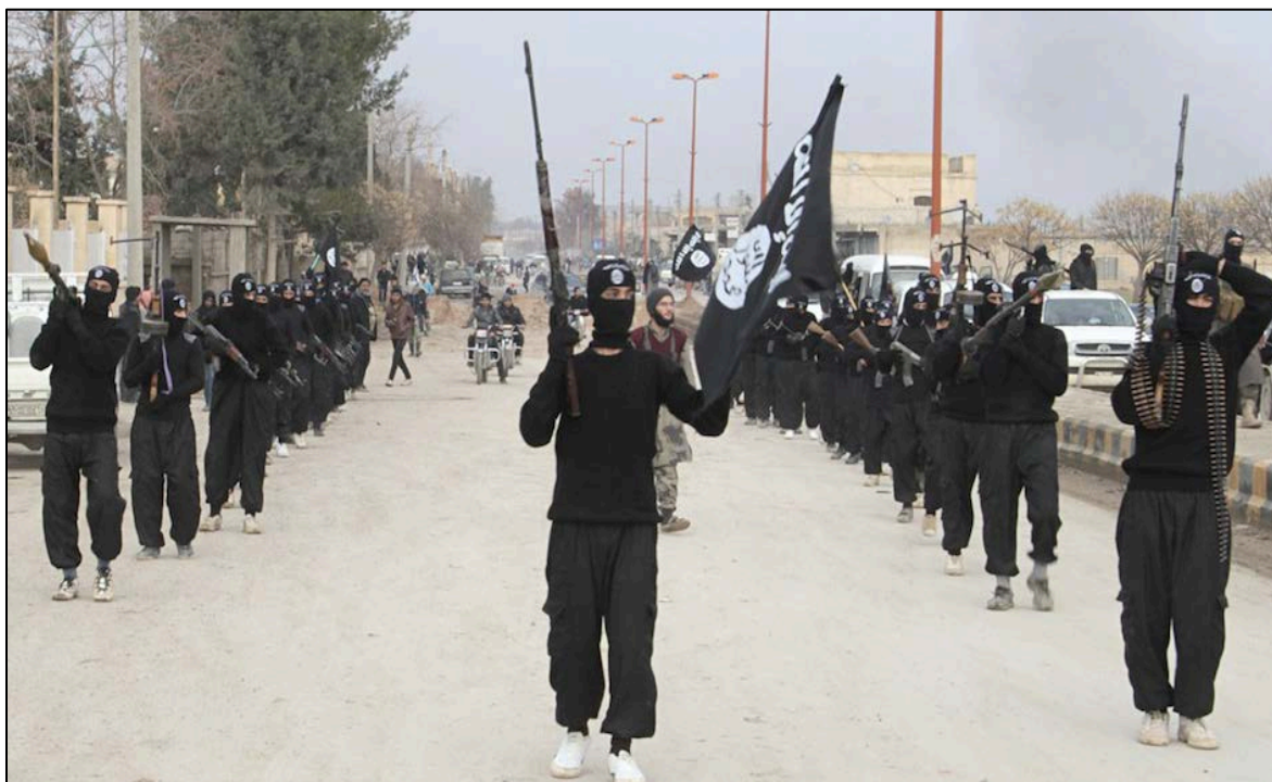
The Islamic State at the peak of its powers

The first question is particularly interesting in IS's case. In many ways, IS mirrors a litany of territorially-focused insurgencies. Between 2012 and 2014, as a clandestine network it exploited areas of weak state control in both Syria and Iraq as well as local- and national-level community conflicts to build a small, but resilient and capable military force. In the face of this force, anaemic Iraqi state institutions in Sunni areas capitulated and the fragile alliance of rebel forces in eastern Syria fell apart. IS took much of its territory largely uncontested in a military sense.