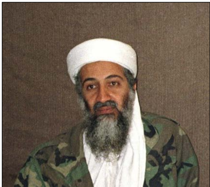
Osama Bin Laden founded al Qaeda in 1988

The first wave covered the period from the Soviet withdrawal in Afghanistan to 9/11. During this time, AQ consolidated into a hierarchical organisation, developed its capability and shifted from the 'near' to 'far' enemy. The origins of AQ lie in the Soviet-Afghan war, with Osama Bin Laden founding the group in 1988 to provide logistical support to foreign fighters who travelled to Afghanistan and Pakistan to fight the Soviet Union. When the war drew to a close, the core of the group moved out of Afghanistan to Saudi Arabia and Sudan, before returning to Taliban-ruled Afghanistan. It saw itself as a vanguard party responsible for organising Muslims in jihad, supporting like-minded groups in overthrowing secular regimes in the Middle East and North Africa. As these