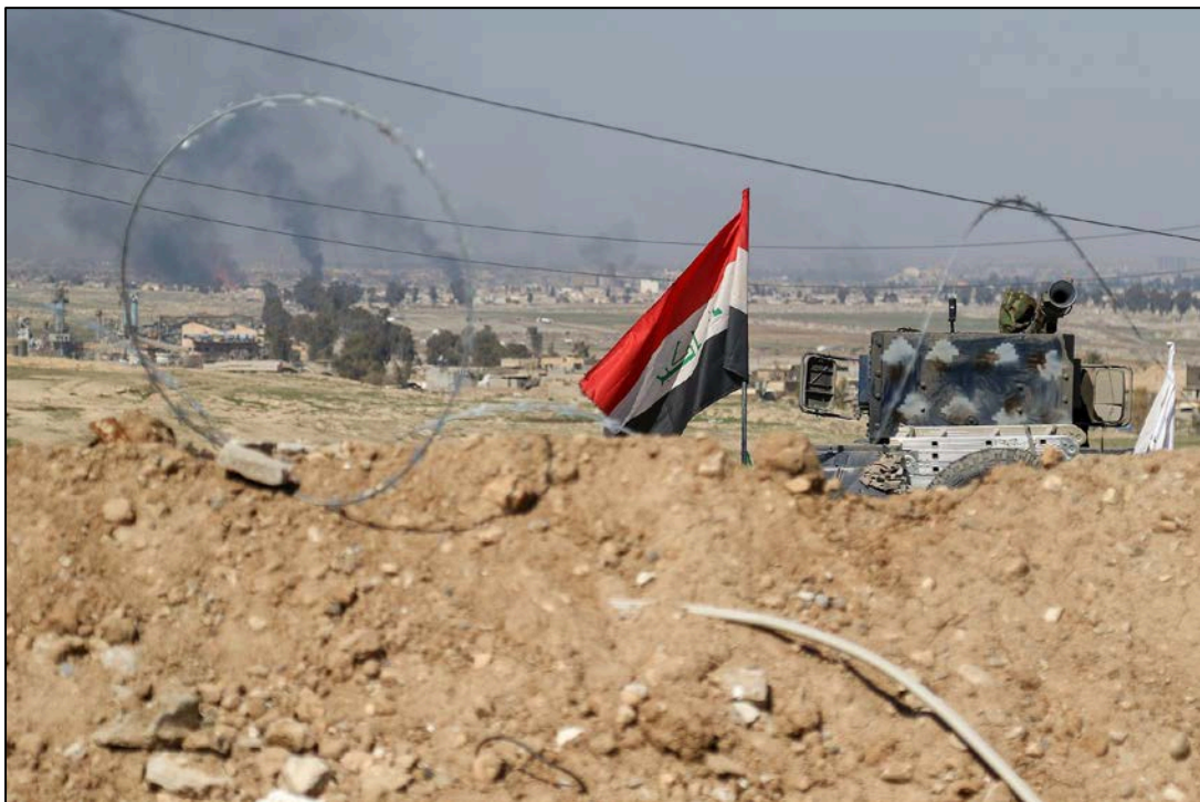
Iraqi forces recaptured Mosul three-and-a-half years after it fell to the Islamic State

Funded by the David Davies of Llandinam Fellowship