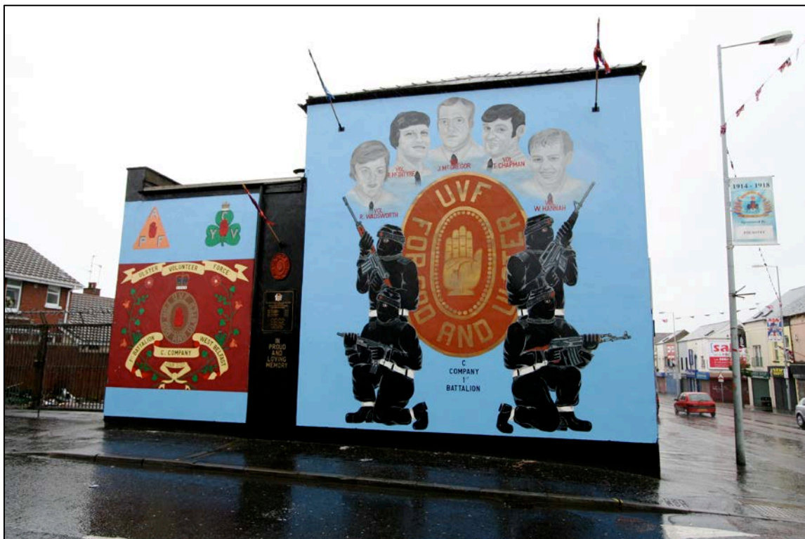
The legacy of non-state actor control in Northern Ireland

institutions more credible than state efforts to replace them. In Northern Ireland, for example, Bakke's work with Kit Rickard (also at UCL), shows that paramilitary groups retain a role in the informal provision of justice in areas they controlled in a conflict that formally ended over twenty years ago. The fact that this can happen in a state as strong as the United Kingdom suggests that this problem will be particularly acute in Syria and Iraq. In many areas, IS empowered local communities who may now be keen to hold onto some of the benefits this brought. Perhaps more importantly, the future of areas previously part of IS's Caliphate remains uncertain. In Syria, various factions are competing for control of IS's former territory. In Iraq, reconstruction in Sunni areas has been uneven and many communities are yet to return home following counter-IS operations. Evidence from other post-conflict zones suggests that IS's legacy as a provider of informal governance to many Sunni communities may provide it opportunities to rebuild influence. Even providing rudimentary justice and security can often prove an effective recruitment tool and enable weakened armed groups to re-establish local legitimacy.