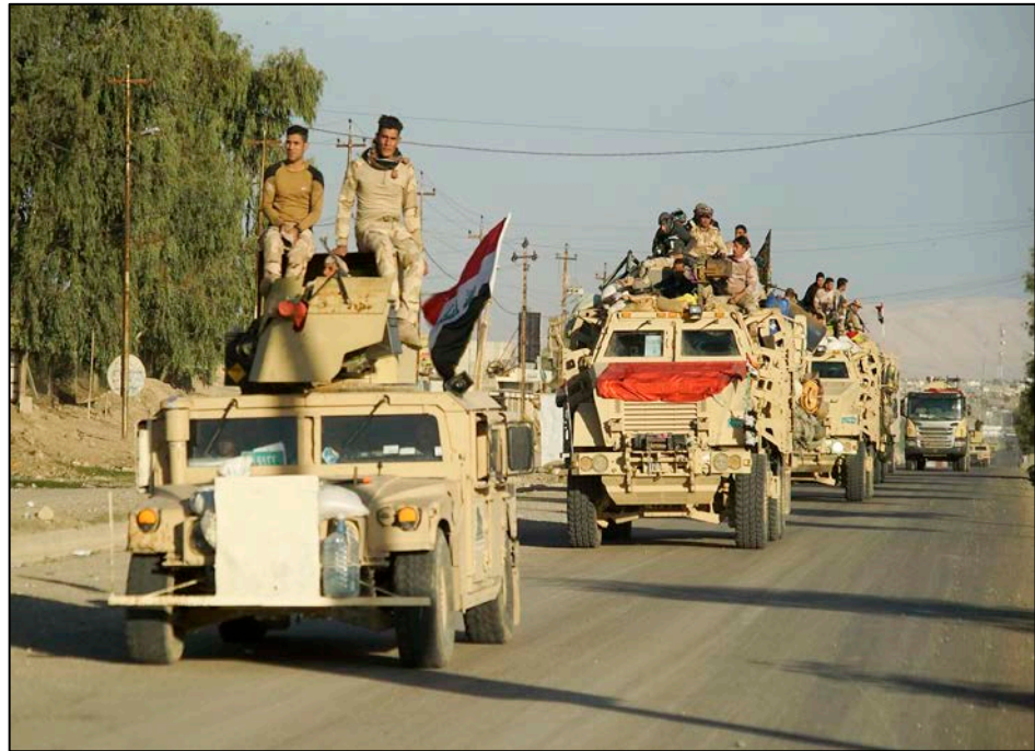
The Iraqi Army recaptures Mosul

Corruption and the use of moral populism has led Iraqi public institutions to lack authority and popular legitimacy. Public institutions have been used to reward political and sectarian loyalty rather than appointments being