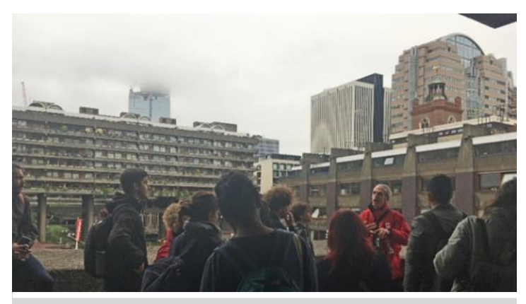
PopFest participants on a guided tour of the Barbican estate

We also had time for a couple of social events, including an evening reception on the LSE rooftop common room, and a guided tour of the barbican estate (the weather just about held) followed by drinks. As the first modern social housing development, it was great to hear a little more about the urban planning and socio-economic considerations of the estate as students interested in population issues.