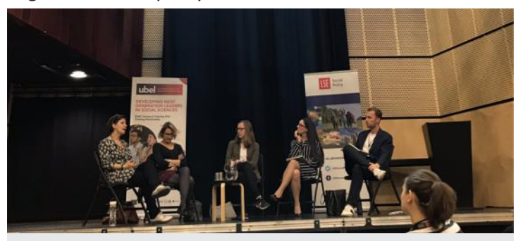
The rights-based approaches to sexual and reproductive health

portance of rights-based approaches as an ethos for guiding research and policy.