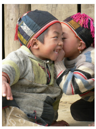
Vietnamese children whispering

Young Lives, the unique 15-year longitudinal study of 12,000 children in Ethiopia, India, Peru and Vietnam, will release the data from Round 3 of its childhood poverty survey on 19 September 2011. The third round of this data will enable researchers to map changes in children's lives over an 8-year period, and to compare what is happening to the Younger Cohort (aged 8) with the Older Cohort who were that age in Round 1.