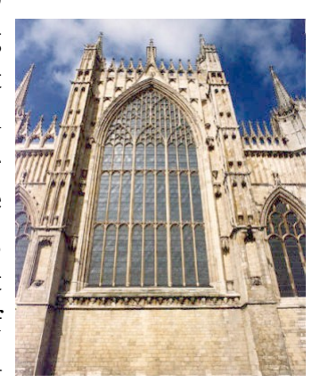
The East Front of York Minster

came Archbishop and started building the cathedral that can be seen today in the centre. The Minster is famous for the Great East Window, the world's largest single expanse of medieval stained glass.