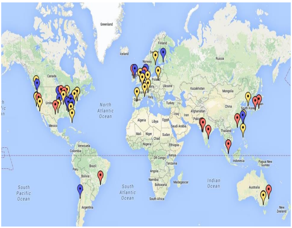
Figure 2: Cloud computing data centers (Amazon: Yellow, Google: blue, Microsoft: red)

make location decisions according to electricity costs, sales tax and other subsidies (Burrington 2015a, Burrington 2015b). Figure 3 shows a map of the cloud computing data centers by three leading firms in the industry: Amazon Web services, Microsoft Azure, and Google. As can be seen, the infrastructure is concentrated in limited locations in mostly developed countries in the United States, Europe, Australia and Asia to serve those markets.