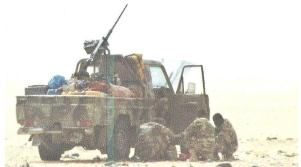
Figure 1 Correction: Niger army