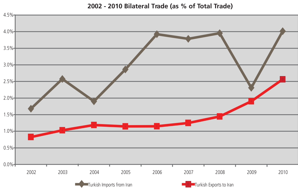
Chart 2: Turkish-Iranian Trade from 2002-2010 in as a percentage of total Turkish trade.