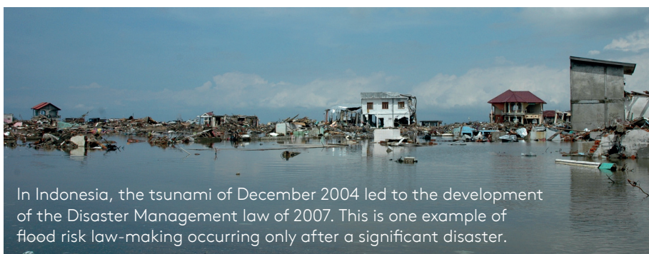
In Indonesia, the tsunami of December 2004 led to the development of the Disaster Management law of 2007. This is one example of flood risk law-making occurring only after a significant disaster.

The analysis shows the reactive nature of law-making for flood risk, which usually happens only after a significant disaster rather than as a proactive intervention to reduce risk. For example, in the United States the National Flood Insurance Act of 1968 was passed as a result of the loss and damage caused by the Hurricane Betsy flood surge in Florida and Louisiana in 1965. In France, following serious flooding in 1981, a law was passed in 1982 to institute a new compensation system for natural disasters (Magnan, 1995). In Germany, the one-in-100-year flood of summer 2002 prompted the federal parliament to pass the Flood Control Act in 2005, which introduced nationally binding requirements for the prevention of future flood damage. In Indonesia, the tsunami of Boxing Day 2004,