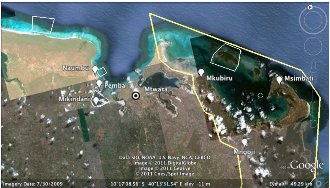
Fig 2 Map of local area indicating study villages, Marine Park and hypothetical closure sites

Marine park border shown outlined in thick yellow. Taken and adapted from Google Earth (Version 6.0.1.2032) [Software]. Mtwara coastal view, TZ: Google Inc (2011). Available from: http://www.google.co.uk/intl/en_uk/earth/index.html