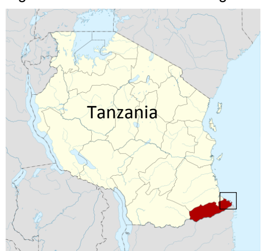
Fig 1 Location of the Mtwara Region and study site within Tanzania

Mtwara Region shown as shaded area. Boxed area indicates coastal area and location of study sites. Adapted from <a href="http://en.wikipedia.org/wiki/Mtwara">http://en.wikipedia.org/wiki/Mtwara</a> Region (12 June 2011).