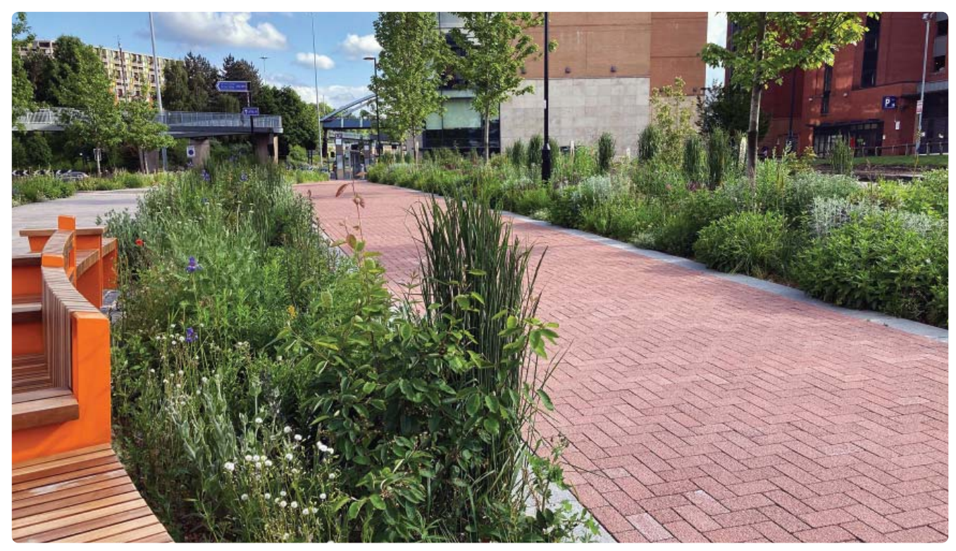
Sheffield's Grey to Green scheme—improving biodiversity and flood resilience can help to create attractive city centre spaces

we want to go, how we plan to get there, and what milestones we expect to pass on the way.