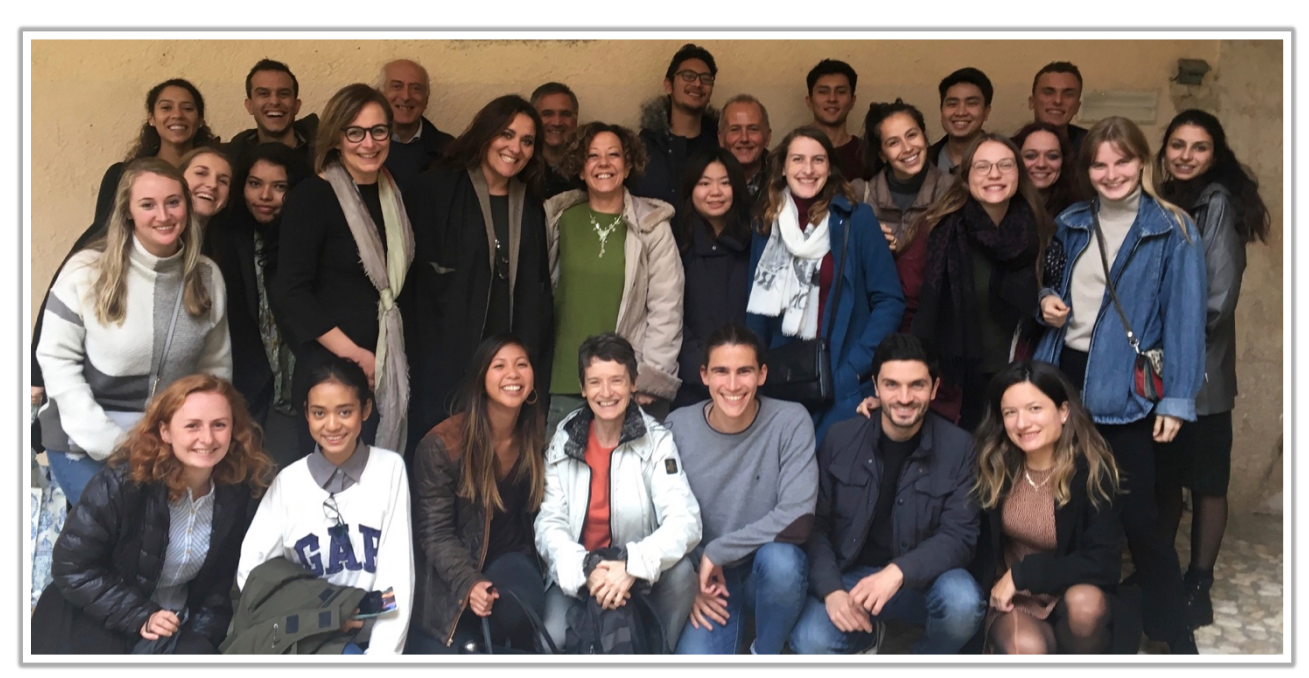
A city to be loved