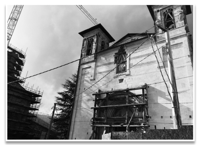
L'Aquila. A city in transition