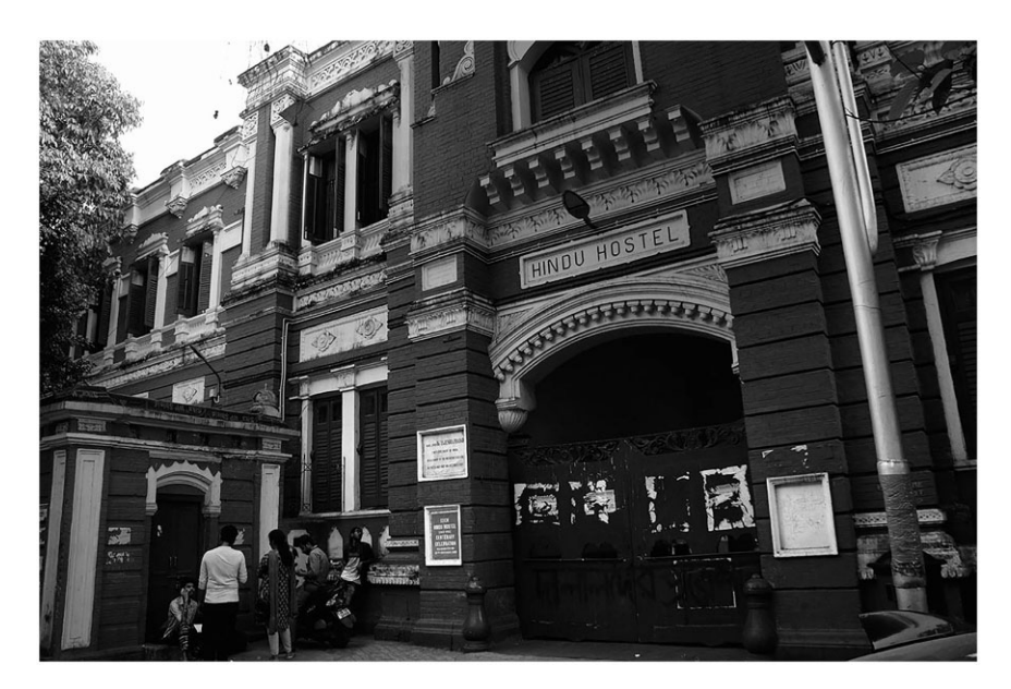
Figure 9: Hindu Hostel. It is from the first floor that nocturnal cries for Sonali used to emerge. Photographer Bijoy Chowdhury, 29 March 2022.

Years later, I went back to the hostel and enquired with the boarders about Sonali, the common source of inspiration in our times. It didn't surprise me that she was still being called out for as she sat every night next to the hostel gate holding her newborn on her lap, dusky skinned, husky voiced. Looking back, the