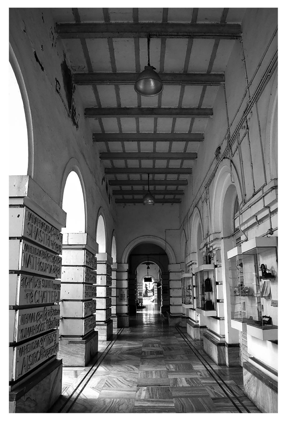
Figure 7: College Portico. 29 March 2022.