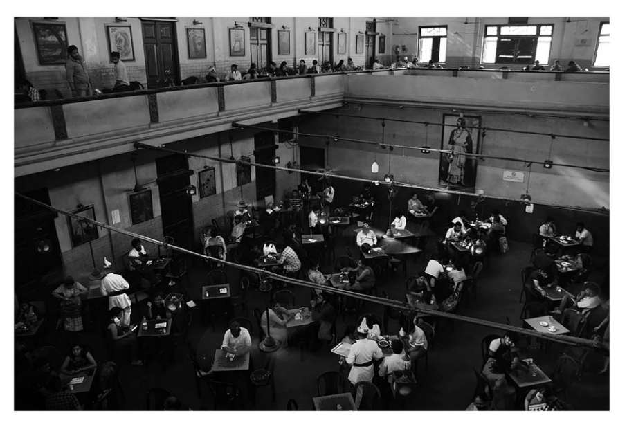
Figure 5: College Street Coffee House. 29 March 2022.