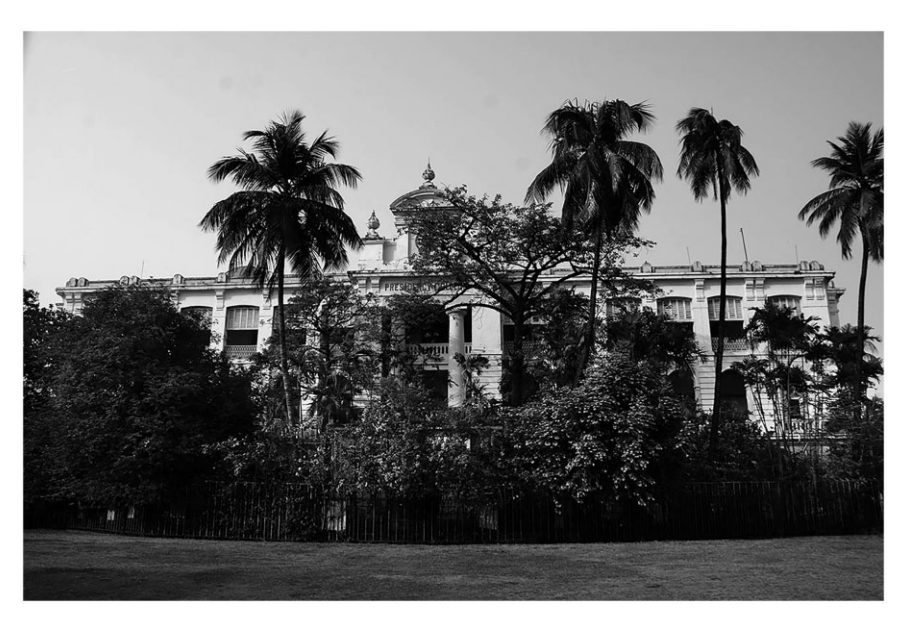
Figure 6: Presidency College (now Presidency University). Photographer Bijoy Chowdhury, 29 March 2022.