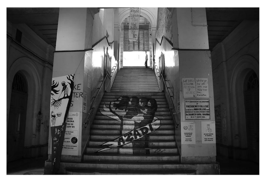
Figure 8: The Long Steps, Witness to History.

particular room. I took a peep and realized that one of our mates had lost his sanity. Lying on the bed, he kept murmuring in a sing-song, wavering voice 'Chorui Pakhi, Kutur Kutur'. It didn't mean anything, apart from suggesting that twittering sparrows were having fun. Apparently, he had been doing that for the previous few hours in a room that was dark and damp and with the window closed. The secret travelled from one lip to another, and in no time, the entire hostel was a party to that sight. We were told that the chap – a short, thin, quiet fellow from an interior village – had fallen in love with a college girl who wore sleeveless blouses and bileti scent (foreign perfume). No one questioned the inevitability of the fall. He came back to his senses the next morning after being administered a healthy dose of sedative. He looked forlorn, his face shrunk and dry. He was sent back home that afternoon, escorted by a fellow student. After a couple of months, the news reached us that his father had arranged a bride and he was going to get married and look after their land. This was the best his parents could do to rid their son of city vices.