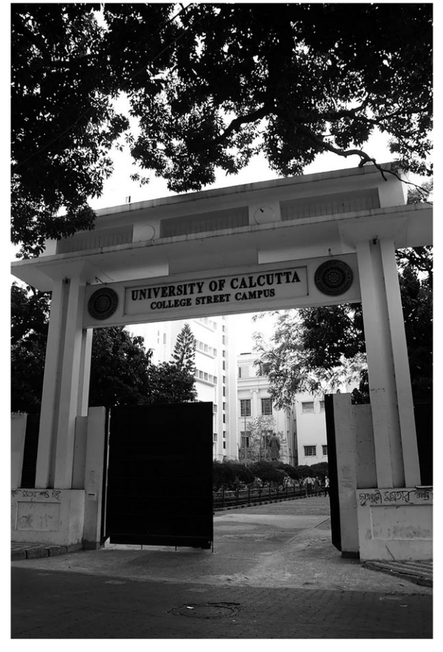
Figure 10: Calcutta University front yard where we displayed the sarees.