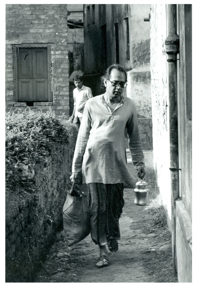
Figure 4: A narrow lane in the congested parts of the city. In the 1970s, such lanes were the site of many a police chase resulting in what in state parlance are known as 'encounter deaths'. Photographer unnamed.

Alipore. The bag contained some books she thought would be useful for the rest of the exams.