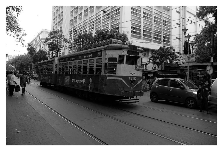
Figure 11: Calcutta Tram, a permanent fixture of College Street. Photographer Bijoy Chowdhury, 29 March 2022

from ordinary middle-class, mostly refugee families were tortured, maimed and killed in droves.