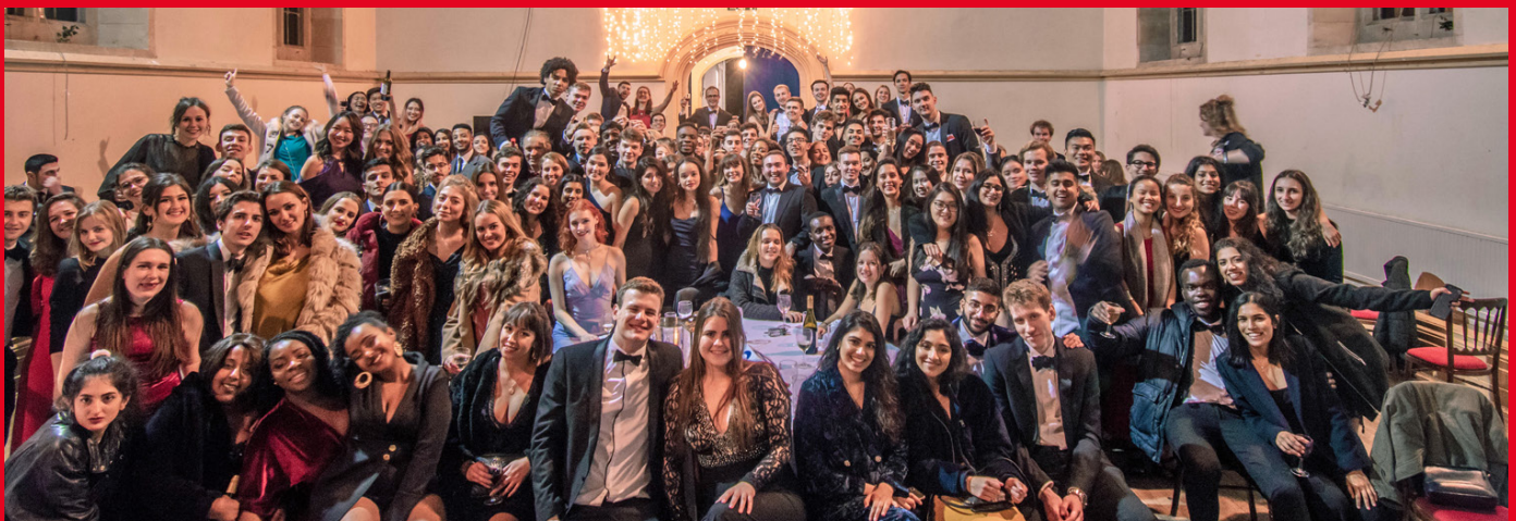
and a Winter Ball!