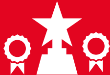
Parties & prizes