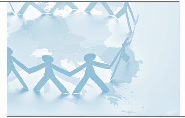
Figure 1: Dimensions and question items of the Reform Barometer