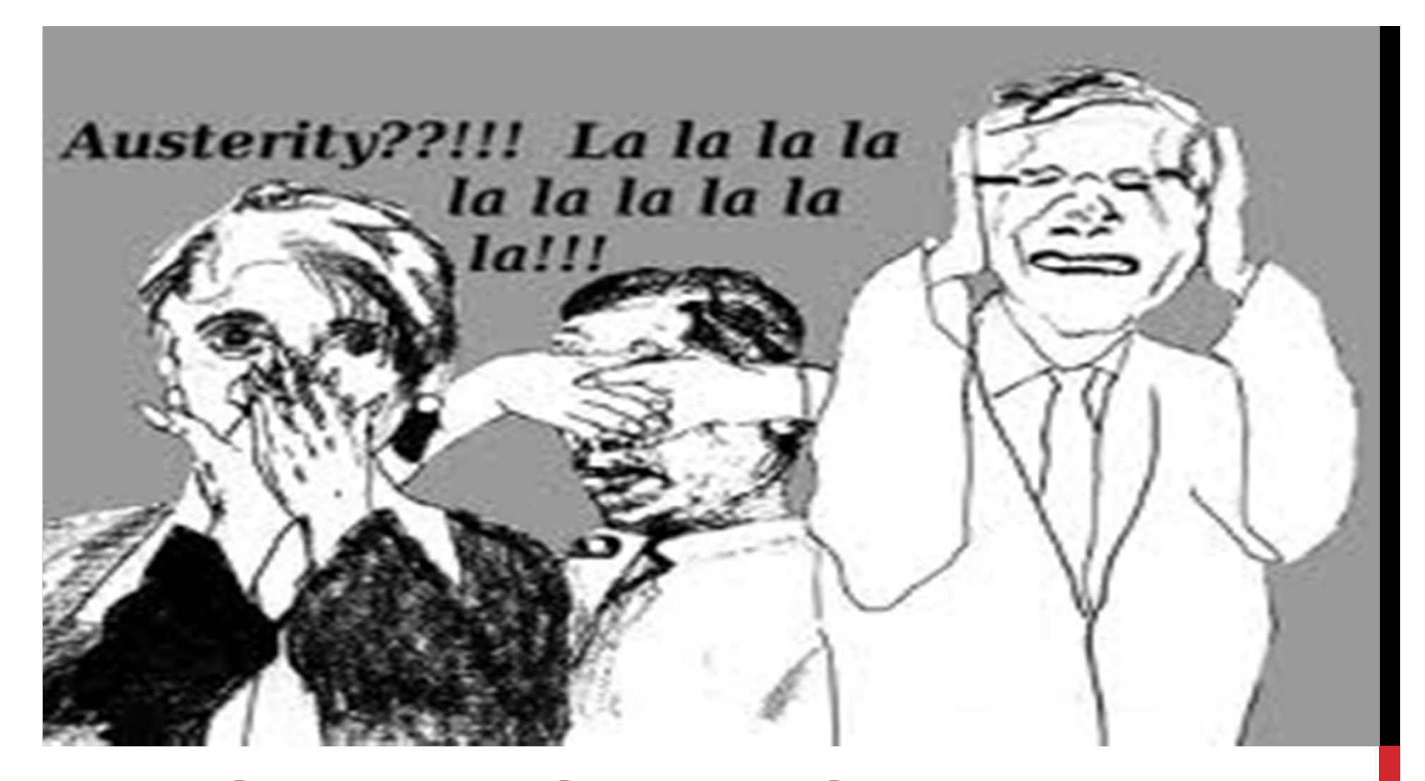
AUSTERITY IS AN ANSWER DESIGNED TO ELIDE THE QUESTION