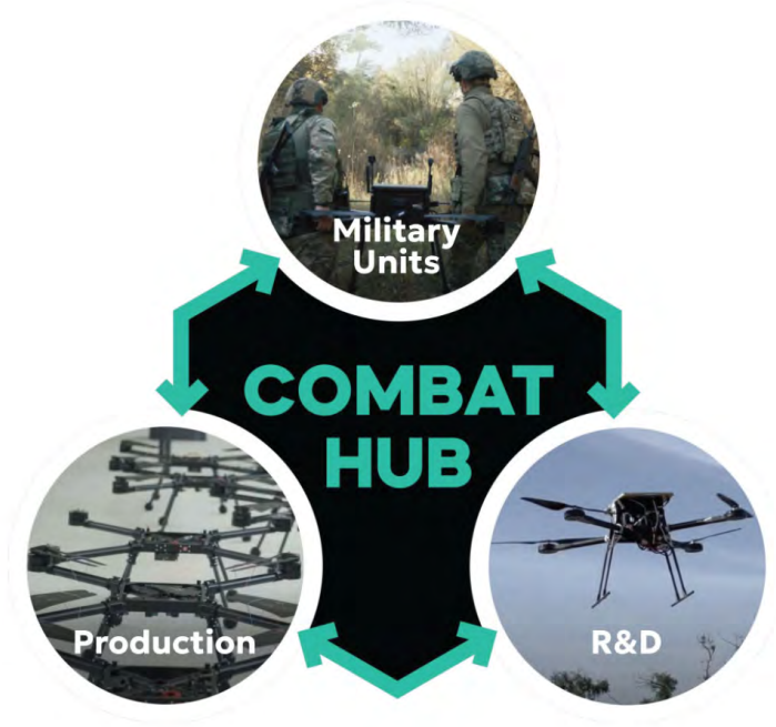
Figure 2. Combat Hub – Structure

Three functional units under a single command – Military Units, R&D, and Production – connected through the central Combat Hub node, forming a continuous adaptation cycle.