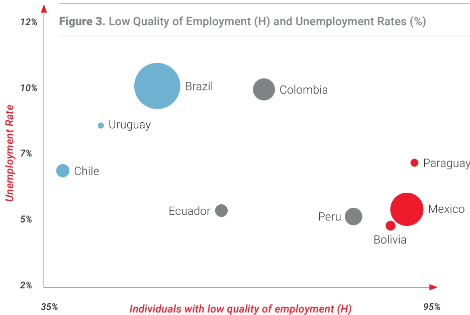
Figure 3. Low Quality of Employment (H) and Unemployment Rates (%)

These findings also suggest that there is no clear association between quality of employment and unemployment rates: