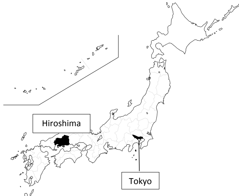
Figure 3: Location of Hiroshima

The prefecture's capital, Hiroshima city, has been an economic centre in the Chūgoku region and home to branches of government agencies and major companies since the Meiji period (1868-1912). 22 In 1871, one of Japan's main military divisions (together with those in Tokyo, Osaka, Nagoya, Sendai, and Kumamoto) was established in Hiroshima city. In 1894, the Sanyō railway was extended to Hiroshima city from the east, and the city became a sending port for