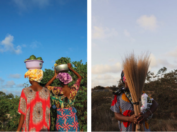
Invisibilized Labour Aida Namukose

“ My body feels exhausted. I feel like changing the current system or the beliefs, especially when talking about gender is exhausting. Fighting the good fight. But I believe it's worth it in the end.”