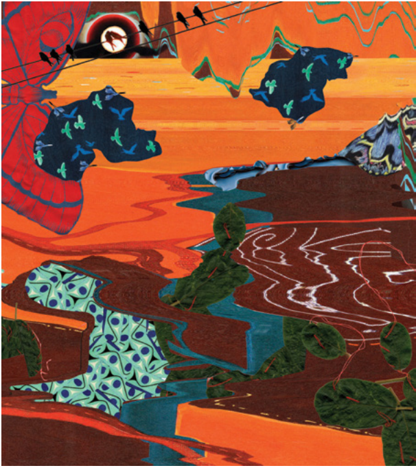
New Horizons Within Halina Rauber-Baio aka Juno Algaravia

“ GDP doesn't include the social production of women. It wasn't meant to serve marginalized groups. It was only meant to serve colonial masters, particularly in Africa.”