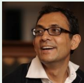
Abhijit Banerjee MIT, co-founder of J-PAL