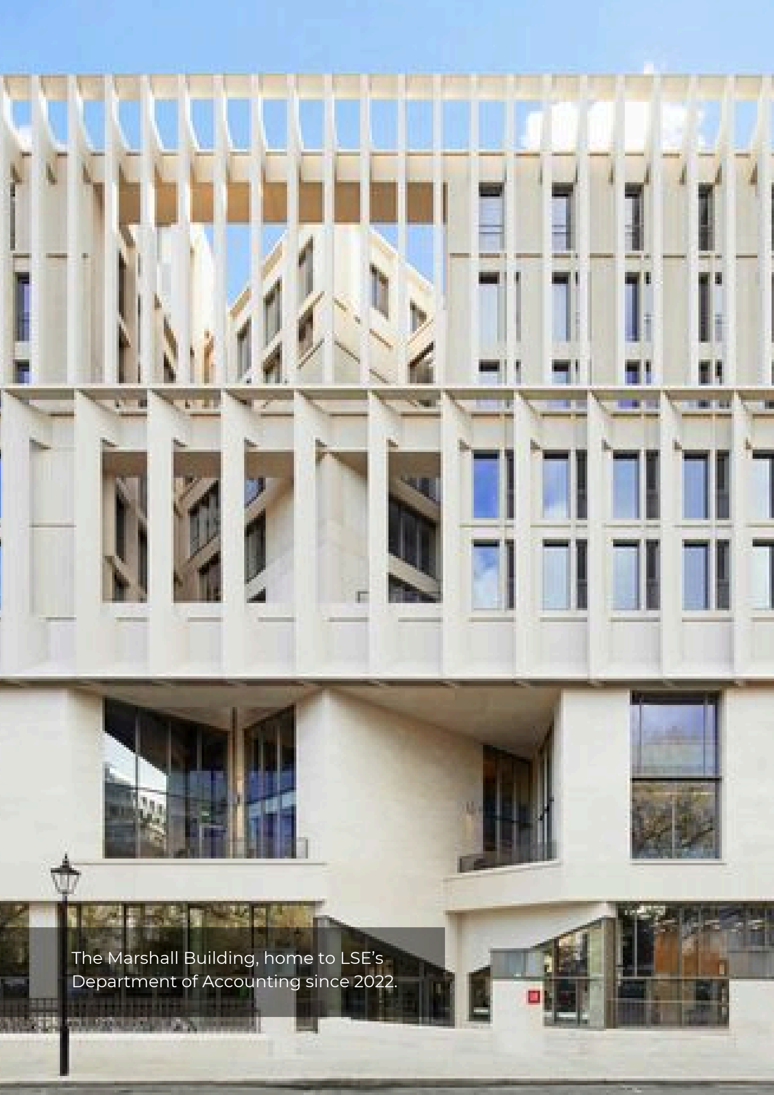
The Marshall Building, home to LSE's Department of Accounting since 2022.