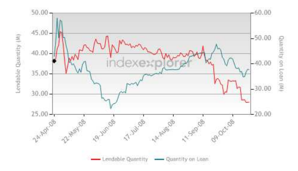
Figure 4: VW shares: lendable and on loan, April – October 2008