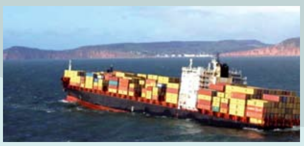
MSC NAPOLI – deliberately beached in January 2007 by direction of SOSREP to minimize the pollution risk. The empty forward section has now been removed, soon to be followed by the stern.

Using the HSE's guidance in Reducing Risks, Protecting People (R2P2) we have measured the risk in commercial shipping under our national statutory and international convention obligation. We've done the same in 21 marine and coastal sport leisure and recreational activities where we provide safety advice and Search and Rescue. We ask ourselves – should we act or is the sport representational body, for example, better placed? How big is the risk? Does the public think this is a risk? How costly are the control options? Is this