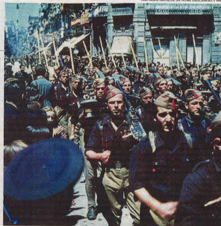
MERCILESS VICTORS Franco's soldiers march in a victory parade in Vigo, Spain, in 1939

Republican soldiers slit their wrists with the jagged lids of their ration tins