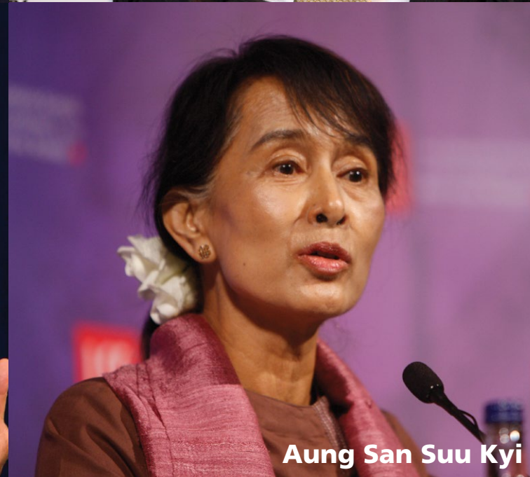
Aung San Suu Kyi