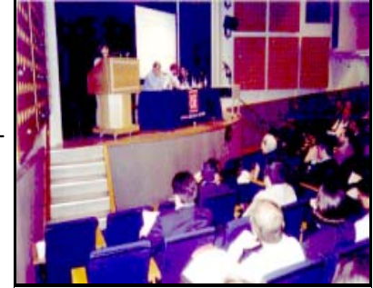
From the plenary session of the Symposium

The purpose was to bring together PhD students in the social sciences who are working on Greece or Cyprus. The Symposium was designed to provide a platform for them to present part of their research and to hear senior academics in their field talk of future research challenges.