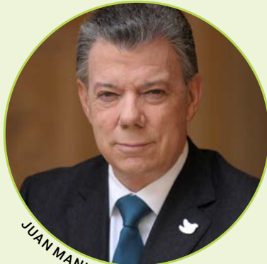
JUAN MANUEL SANTOS