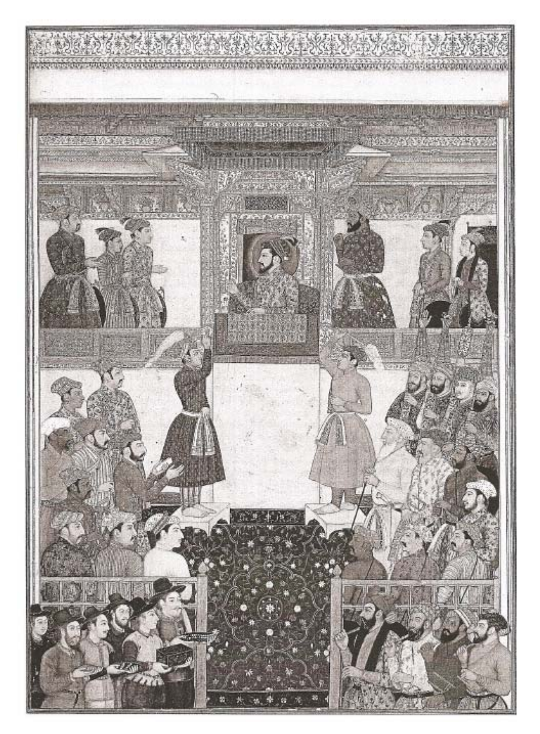
Figure 4.2: 'Europeans Bring Gifts To Shah-Jahan'

On the other hand, it is doubtful that such animals were either as strongly demanded or likely to survive (relative to those transported by land), save be traded by the English. First, Roe notes the persistence with which Jahangir requested that an English horse be sent to him, for both