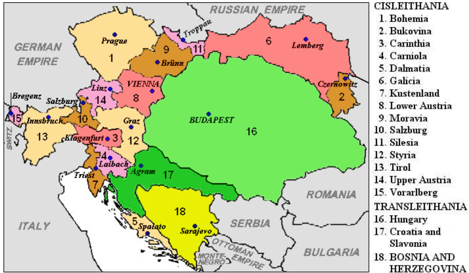
Map 1: The Provinces And Province-Capitals Of The Habsburg Empire Prior To 1914