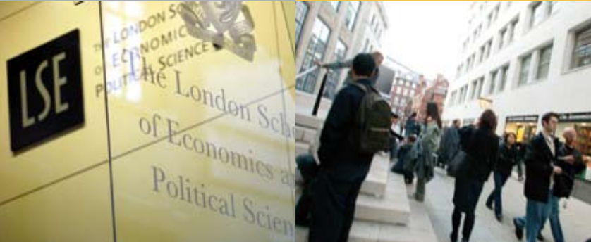
Howard Davies, Director, LSE

LSE’s financial year runs from 1 August to 31 July