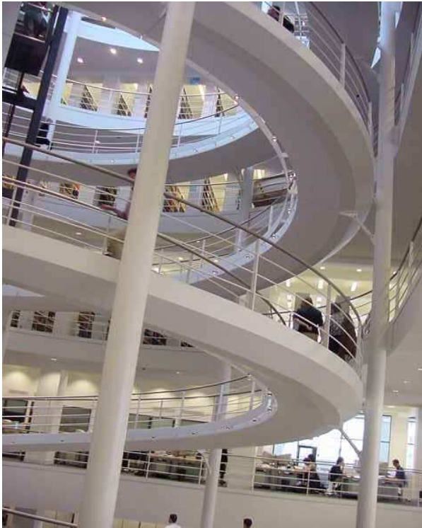
British Library of Political & Economic Science