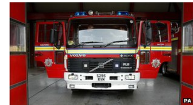
The project aimed to replace 46 fire control centres with nine state-of-the-art regional centres

The plan to replace 46 smaller control rooms was scrapped in December 2010.