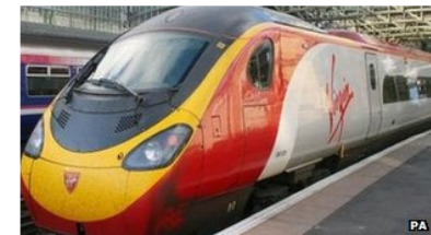
Virgin Trains has run the West Coast Main Line service since 1997

The committee accused the department of making "fundamental errors" and failing to learn from "previous disasters".