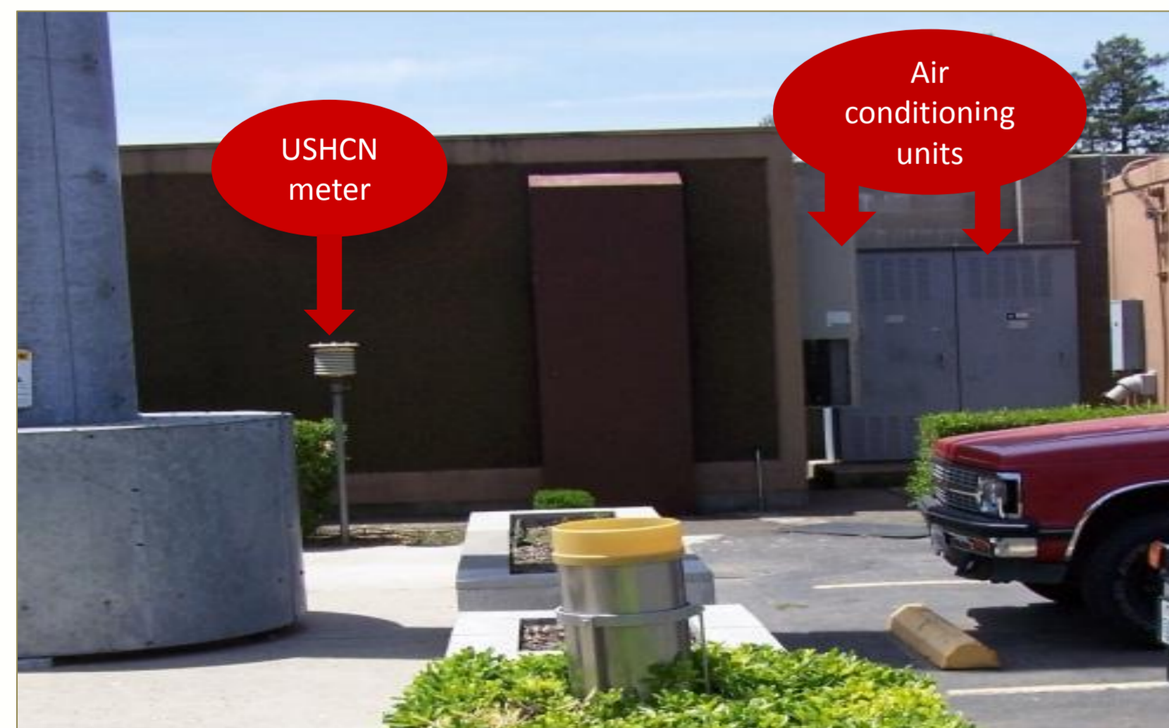
Weather station at Marysville, California

Some errors in the dataset are hard to spot. For example you wouldn’t trust the data from instruments this close to air conditioning units.