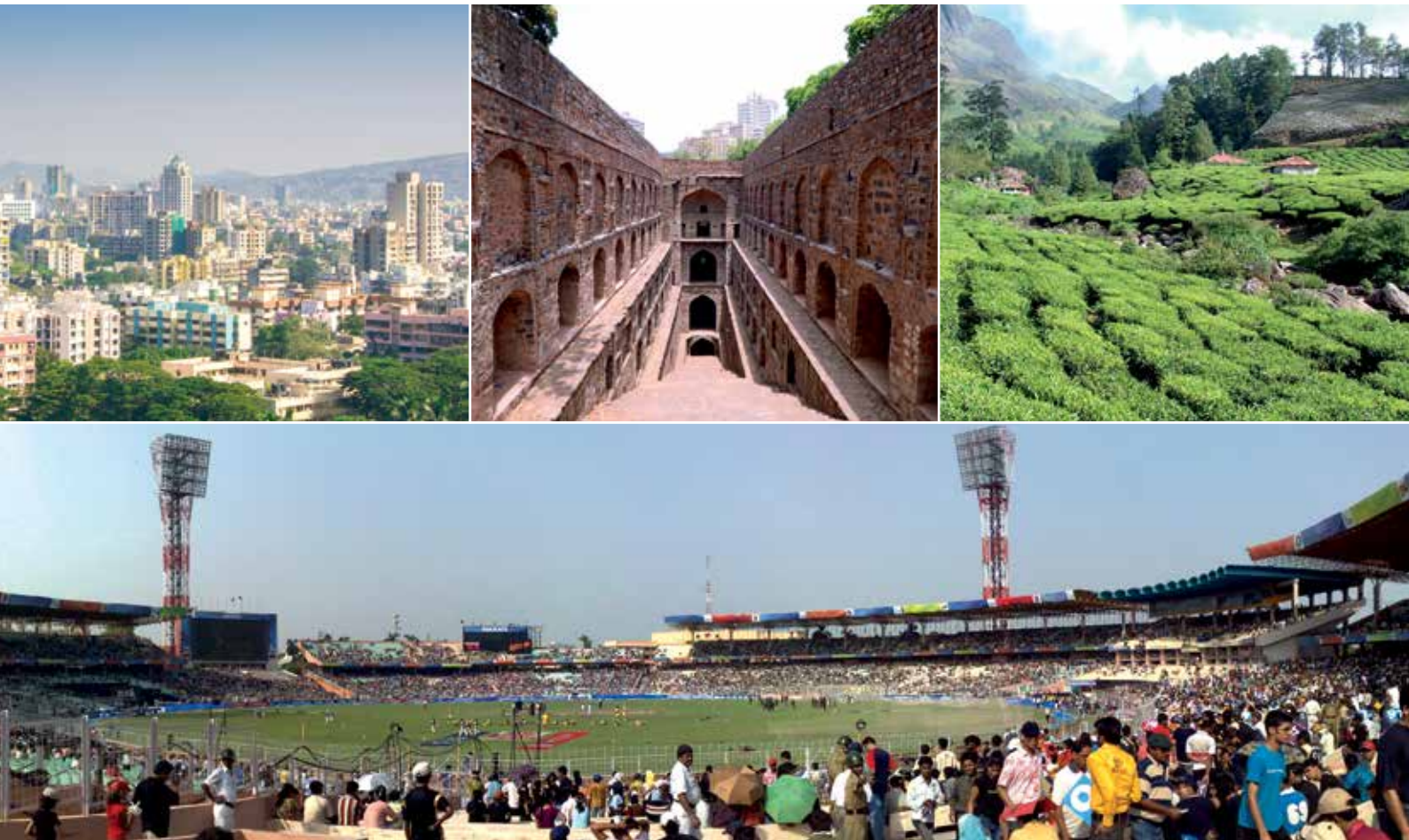
FROM TOP LEFT: MUMBAI SKYLINE IN EVENING LIGHT © CHAMANZINGA/DREAMSTIME.COM; AGRASEN KI BAOLI, STEP WELL IN NEW DELHI © SURONIN/DREAMSTIME.COM; TEA GARDEN IN MUNNAR, KERALA © ARAVIND TEKI/DREAMSTIME.COM; THE EDEN GARDENS IN KOLKATA © PARTHA BHAUMIK.