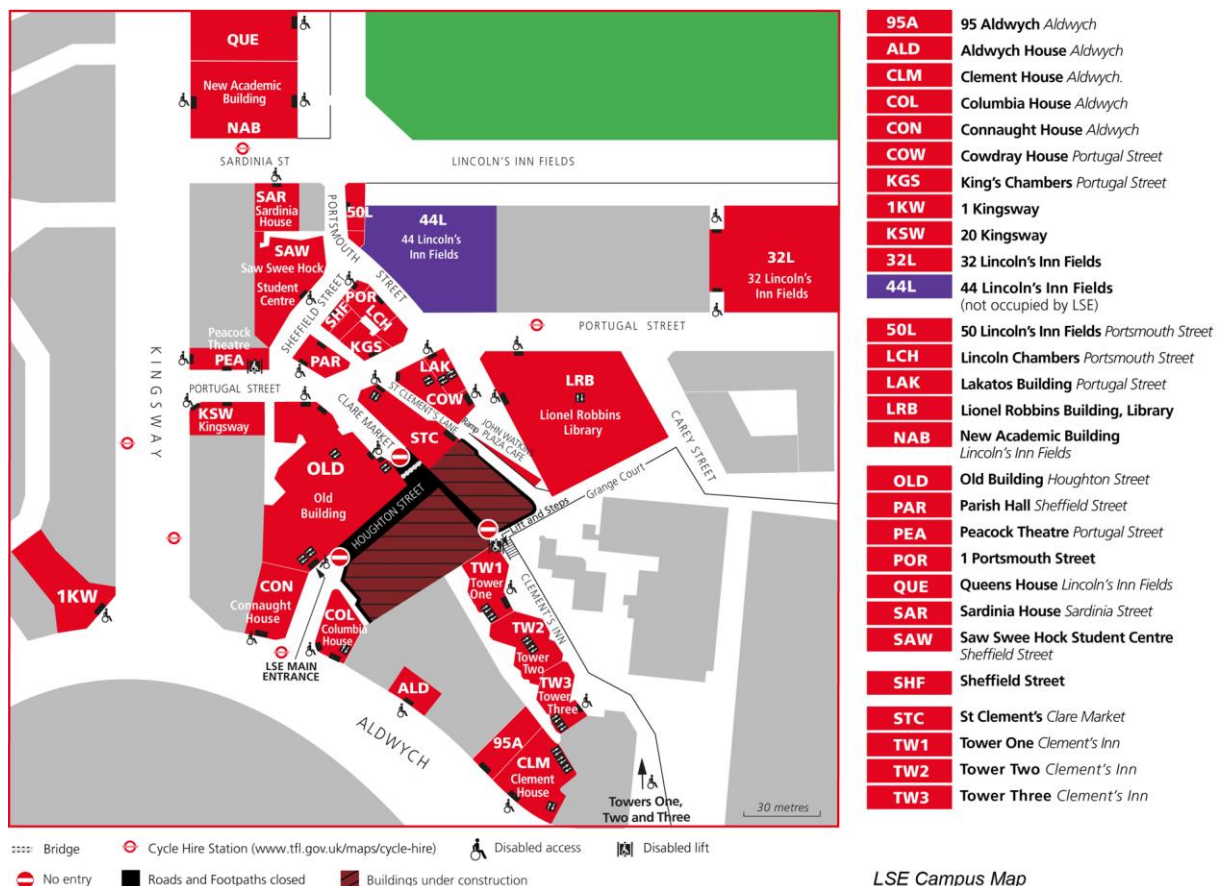
LSE Campus Map

Please refer to the next page for contact details.