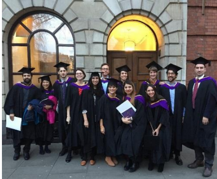
MSc City Design graduates at the LSE Graduation Ceremony December 2016

Cities Programme newsletter issue 19 Lent Term 2017