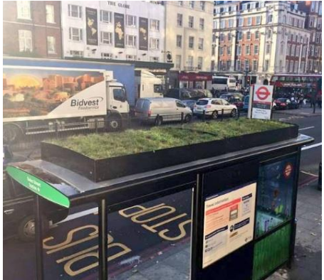
Keep off the grass! TfL's new 'buzzstop'

"We welcome you to visit and post photos and feedback about this new feature on social media using the hashtag #Buzzstop."