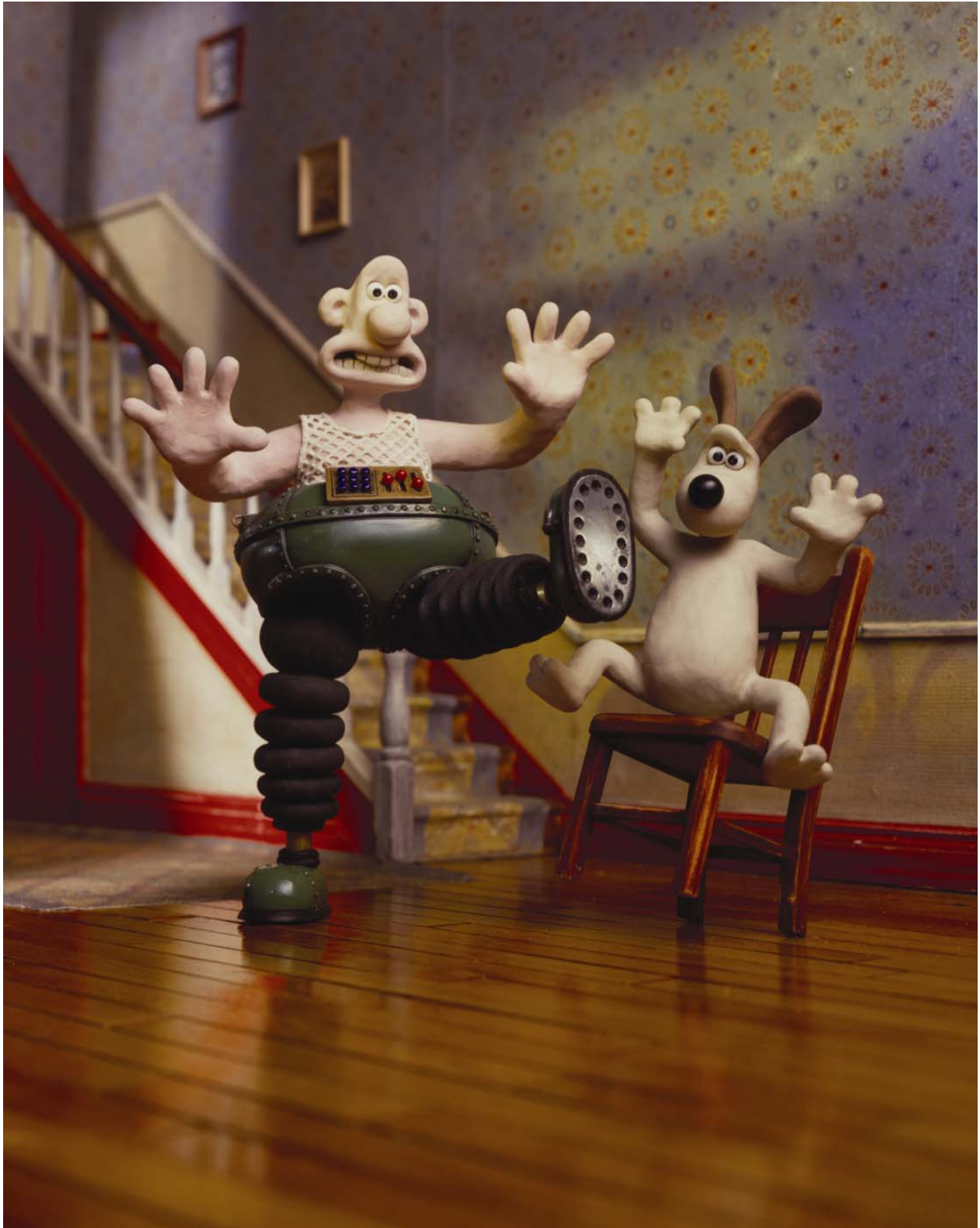
Frontispiece: Wallace, watched by his resourceful dog Gromit is taken places he does not intend to go by the "Wrong Trousers"