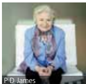
P D James