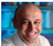
Professor Jim Al-Khalili