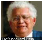
Professor Lord Desai