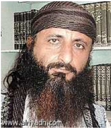
Khaled Abdul Nabi (Top Photo)

Khaled Abdul Nabi is considered the leader of the Abyan Aden Islamic Army, one of many groups operating in Yemen