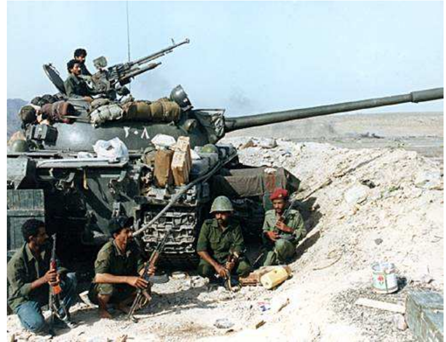
MODERN YEMEN AND FORMER SOUTH YEMEN