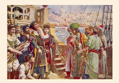
Revisiting the Lusitanian Holding of Hormuz Ghoncheh Tazmini, Oct 2020